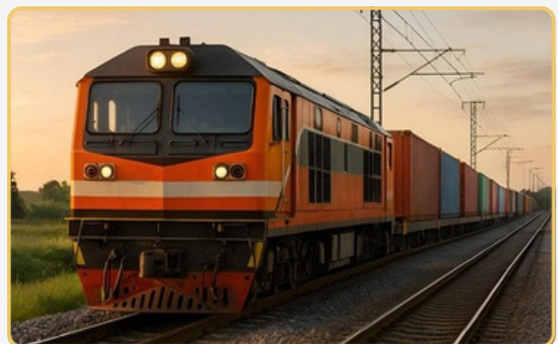
Dholera Freight Corridor