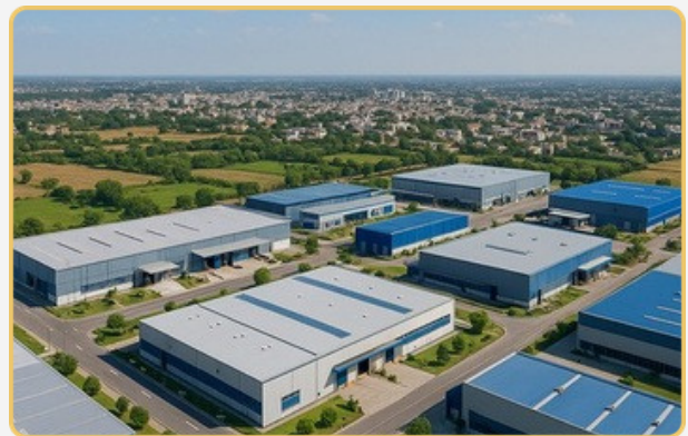
Greenfield Industrial Park