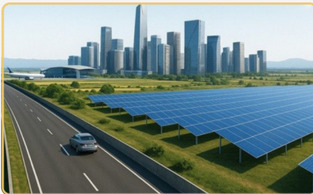
World's Largest Solar Park